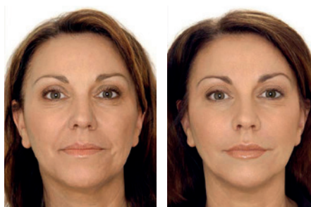
Wrinkle reduction before (left) and after (right)

Don't take our word for it , check out our 5 star Google reviews!